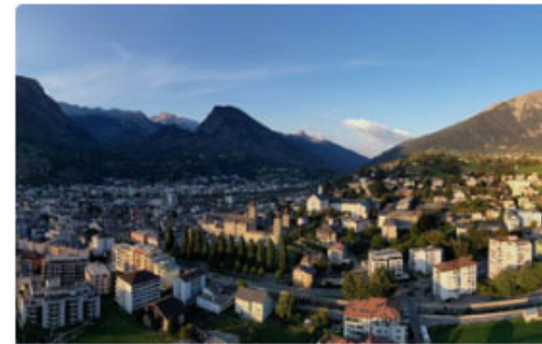
Climate action in Alpine towns