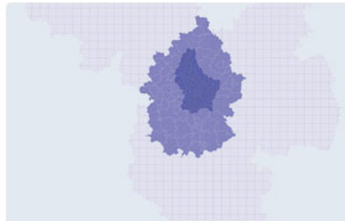
Cross-border spatial planning