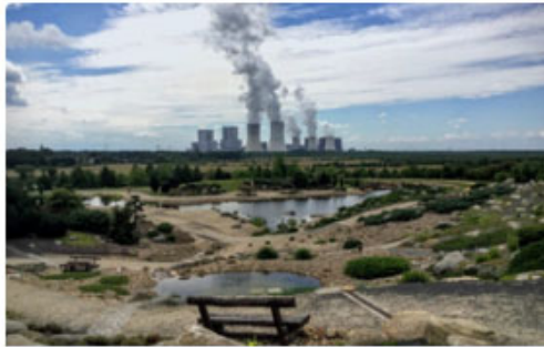
A future for lagging regions