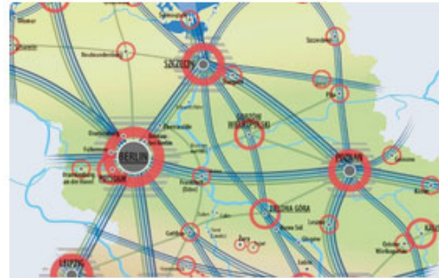
Understanding how sector policies shape spatial (im)balances