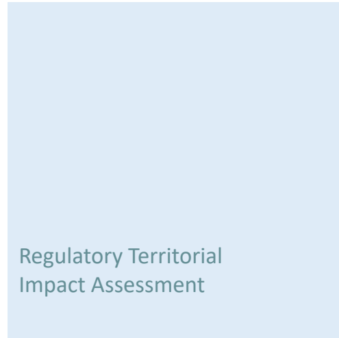
Regulatory Territorial Impact Assessment