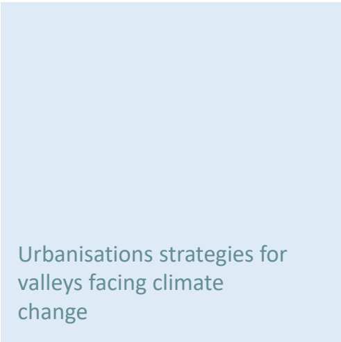
Urbanisations strategies for valleys facing climate change