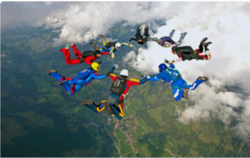
Circular Rural Regions