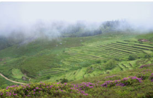
Climate change adaptation and resilience through landscape transition