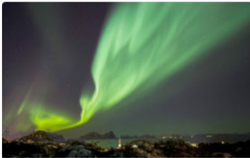
Small places matter