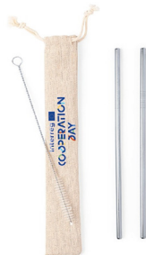
Sets of two metal straws