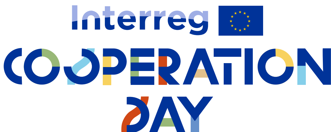
Main Interreg Cooperation Day Logo

Along with the new official name, the second major change is the logo, a design that will be part of the campaign's branding for the entire period 2021-2027.