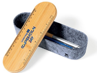
Bamboo and felt pencil case

Based on the overwhelmingly positive results of the survey, the discussion and the feedback from the past campaign evaluations, we have decided to produce: