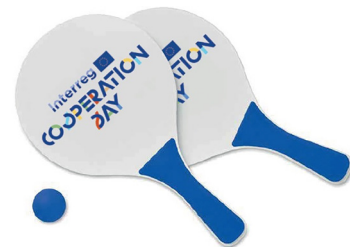
Sets of beach-tennis rackets

Since we have a limited budget for promotional materials, we will produce around 40 sets of promo materials with limited quantities of items in each. When selecting the materials our focus was on inexpensive and light (cheaper to transport) options, which are also environmentally friendly and practical.