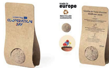
Wildflower seeds packs