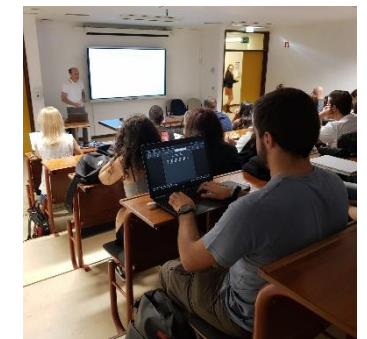
Project dissemination at University of Minho (Portugal)