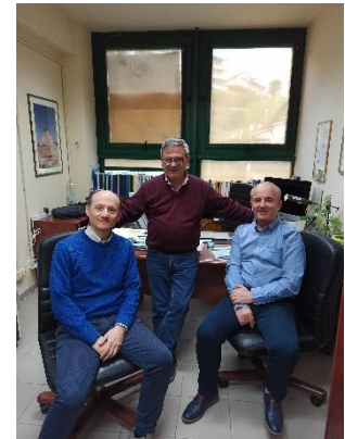
Visit of the Albanian partner in Italy