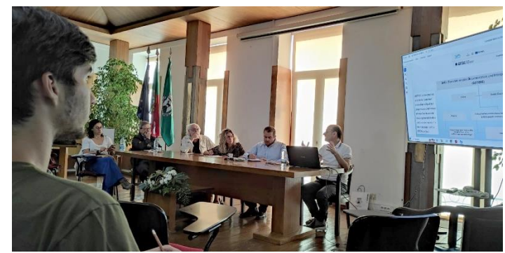
Meeting with the Comunidade Intermunicipal do Cávado (CIM Cávado-stakeholder-, Portugal)